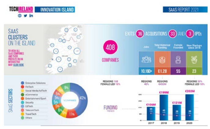
Fig 1: TechIreland.org - SaaS Report 2021.

Technology: Ireland's technology sector continued to perform strongly through 2021 with LetsGetChecked and Fenergo joining the ranks of Ireland's growing list of 'unicorns'*. Both businesses secured strong support from international investors, a further endorsement of the strength and reputation of Ireland's indigenous technology sector. TechIreland.org also published its Software as a Service (SaaS) report for 2021, capturing the continued growth of the sector with over 400 Irish technology companies classified as SaaS, creating solutions in artificial intelligence (AI), talenttech (recruitment), customer relationship management (CRM) and internet of things (IoT). The report highlighted data on activity for Irish SaaS companies during 2021 that saw 33 companies being acquired while three companies completed initial public offerings (IPO), see Fig. 1. below.